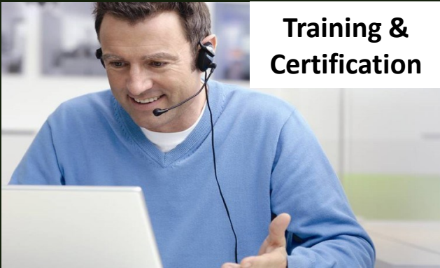
Training & Certification