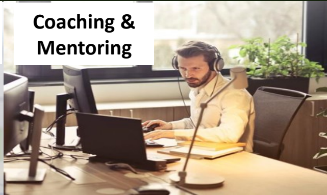
Coaching & Mentoring